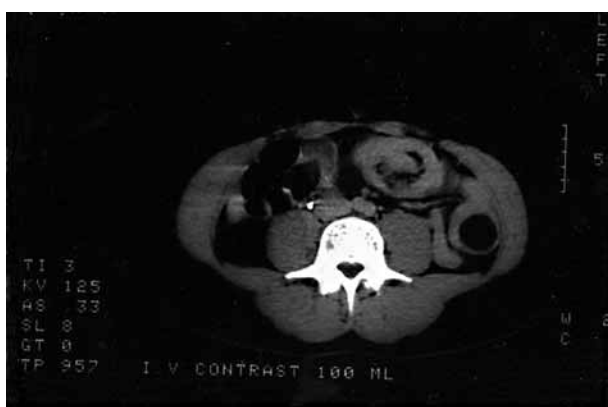
Figure 2. — Abdominal CT showing a target-like pattern in the area of the cecum.

been proposed to be associated with ICV lipohyperplasia, which correlates to some extent with right ventricular and pancreatic fatty infiltration (5). However, Tawfik and McGregor (2), in a study of 8 cases of ICV lipohyperplasia found no definite correlation with left ventricular, adrenal or lymph node fatty infiltration, or with hepatic fatty changes, body height, age of patient, or blood glucose level.